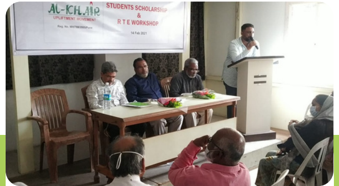
Scholarship Scheme Workshop