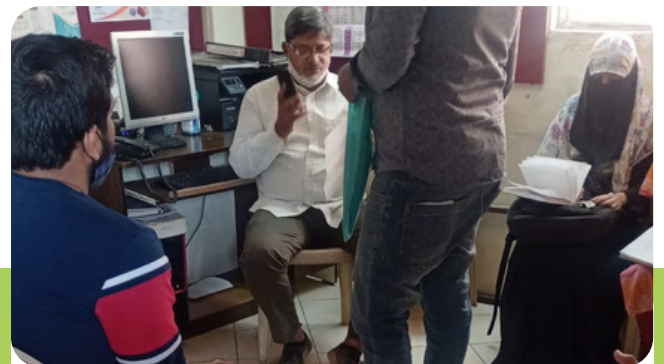
RTE Online Training